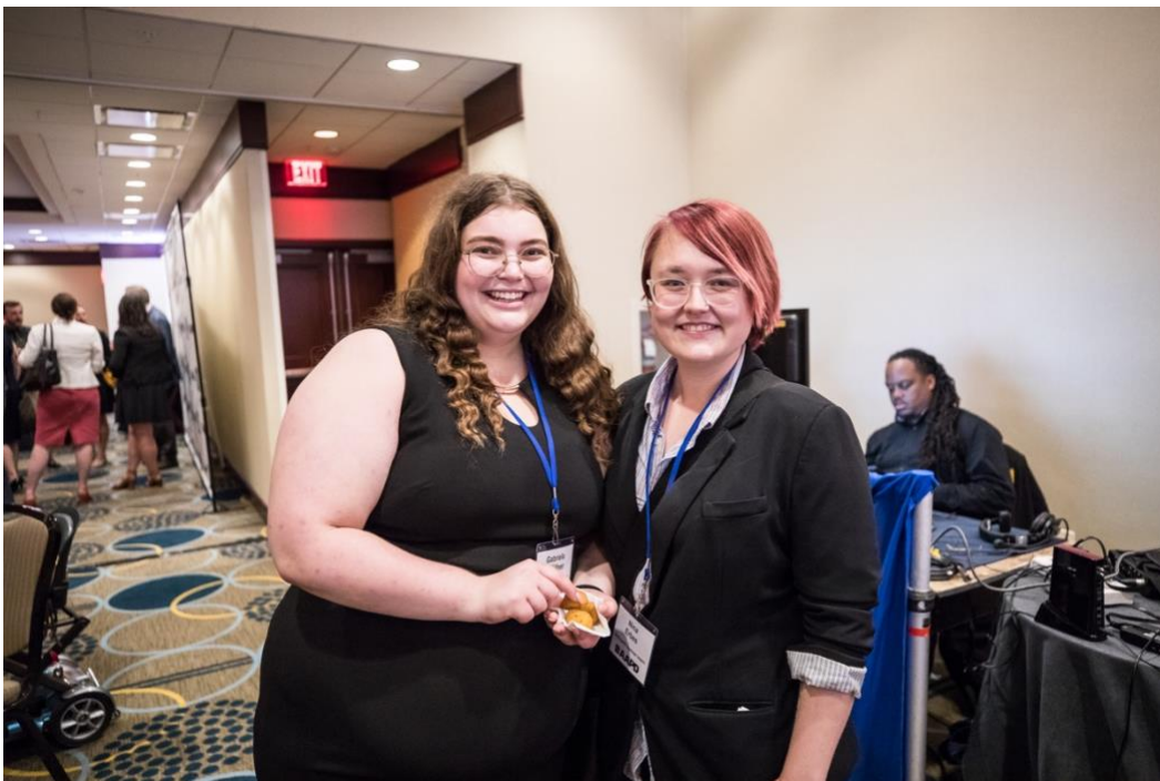
Photo: AAPD Interns attend the AAPD ADA Celebration