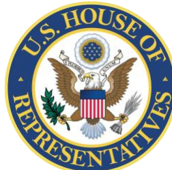
Congresswoman Rashida Tlaib (D-MI)