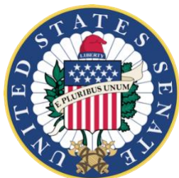
Senator Elizabeth Warren (D-MA)