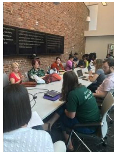
Photo: AAPD Interns participate in Disability Advocacy Certificate Program classes