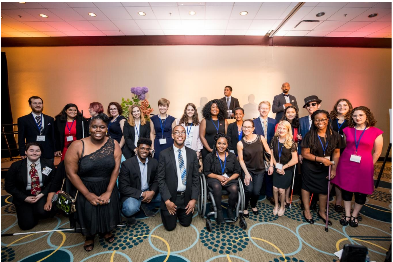
Photo: AAPD Interns at the AAPD ADA Celebration