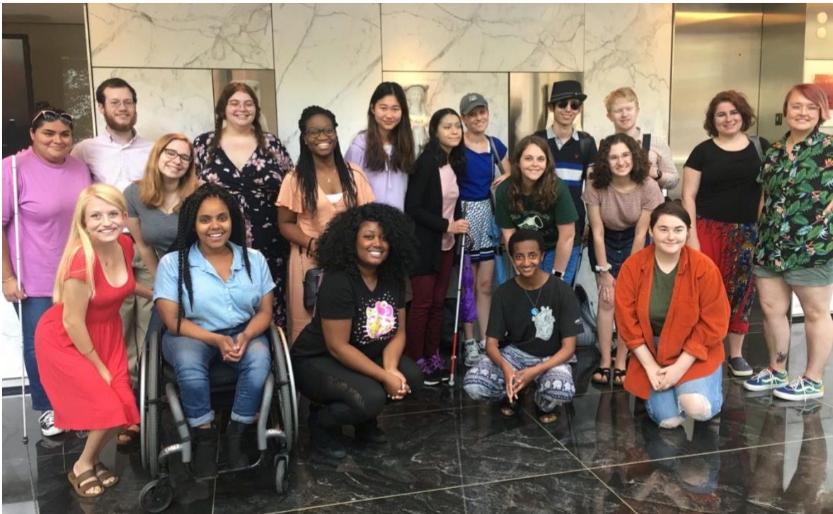
Photo: AAPD Interns visit the AAPD offices

that promotes school spirit and inclusion across the community.