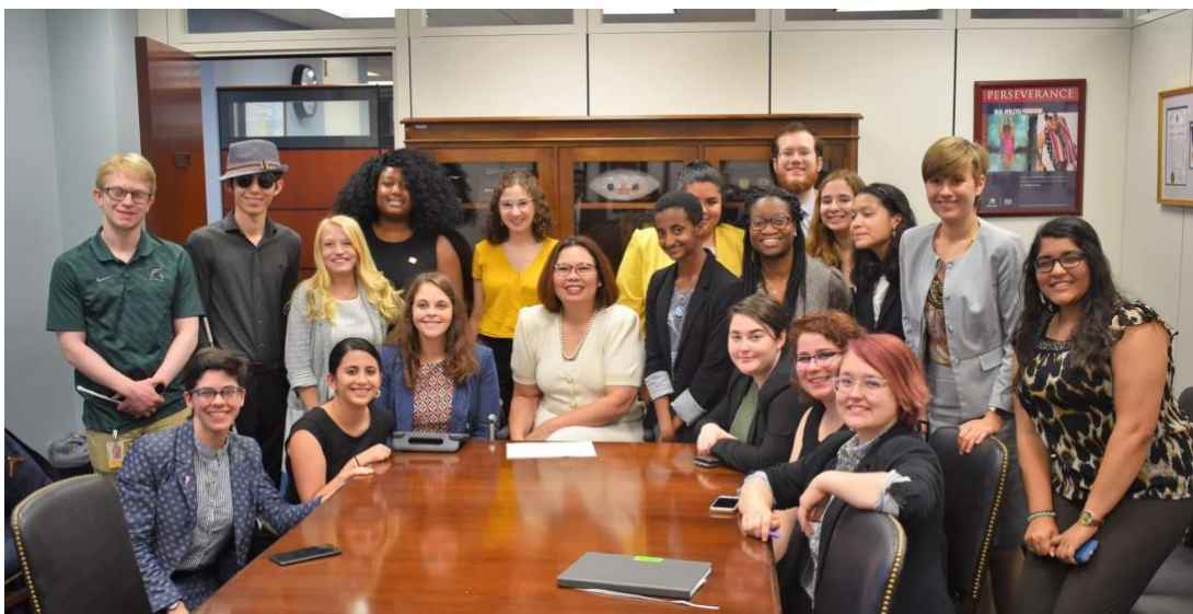
Photo: AAPD Interns meet with Senator Tammy Duckworth