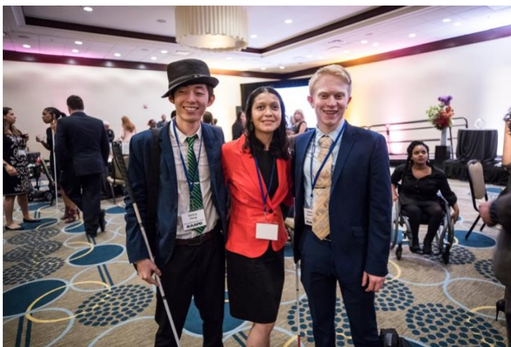
AAPD Interns at the AAPD ADA Celebration