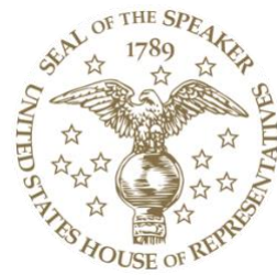
Speaker of the House Nancy Pelosi (D-CA)